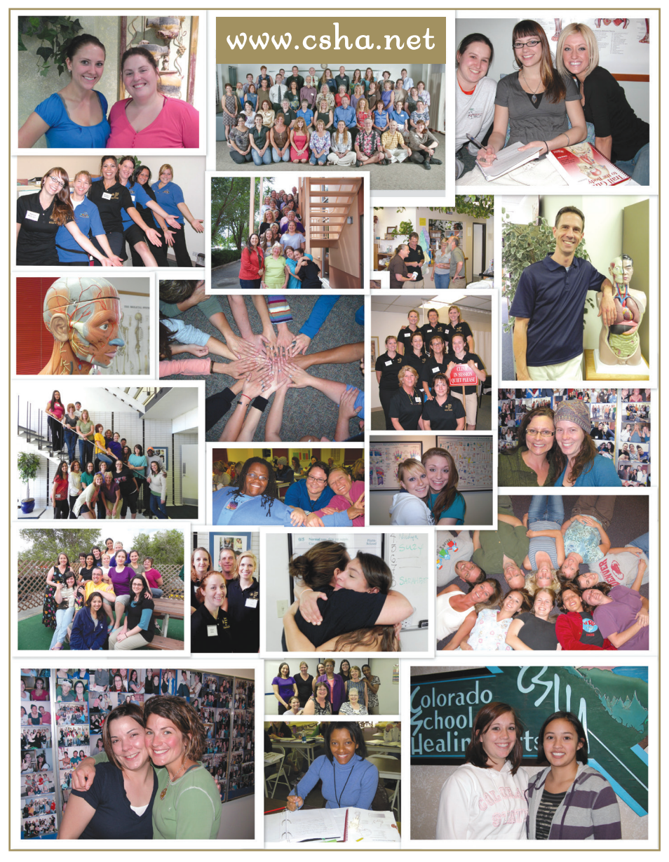
CSHA is about ...instruction, skill, service, trust. It's about you!

f Find us on Facebook-Colorado School of Healing Arts (CSHA)