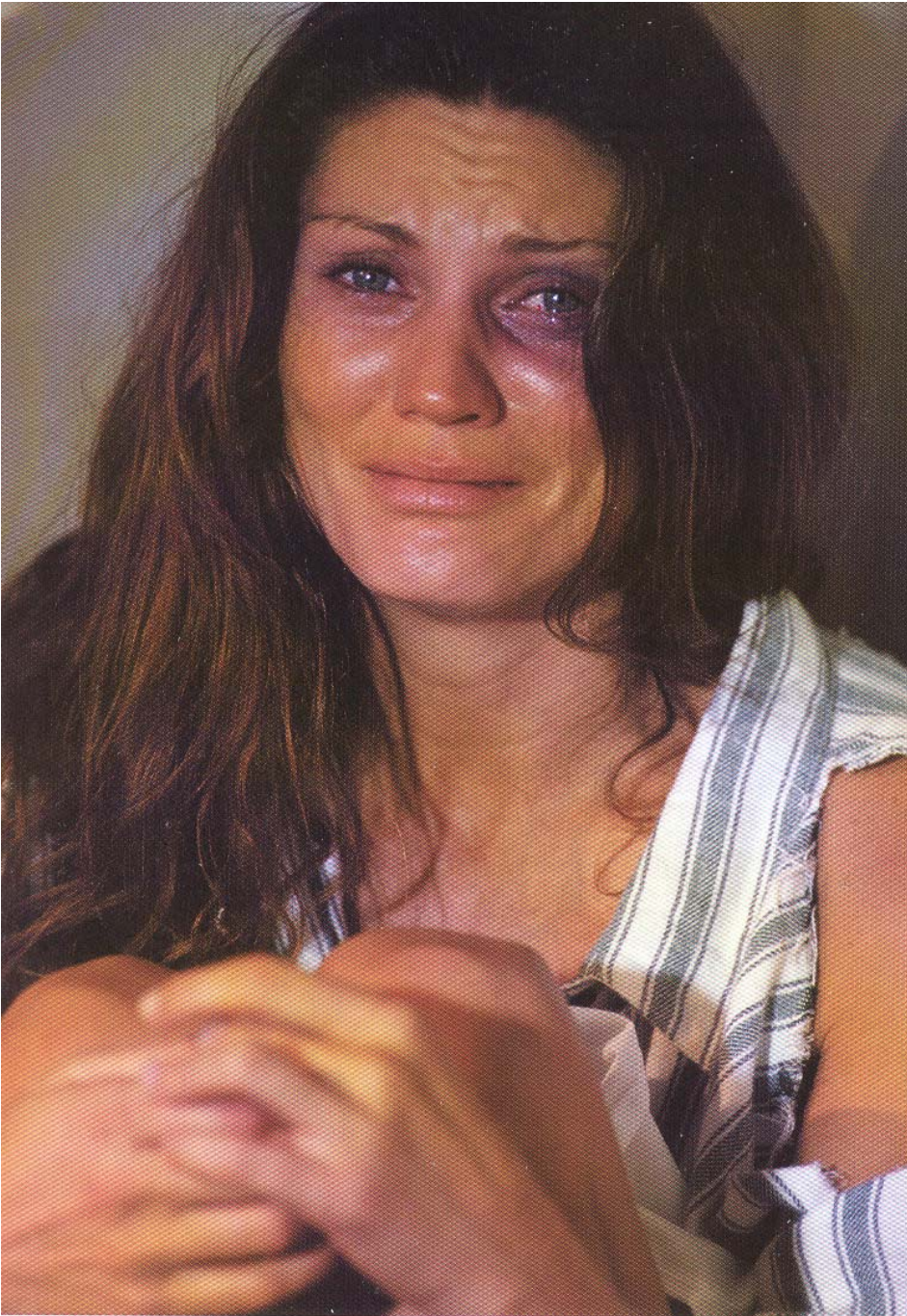
Trauma Touch Therapy is an effective modality, not only for survivors of domestic violence, but truly for clients who've experienced all ranges of trauma and shock.

and now; people who've forgotten what it feels like to "feel."